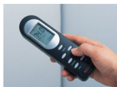
FireGenie® RF remote control