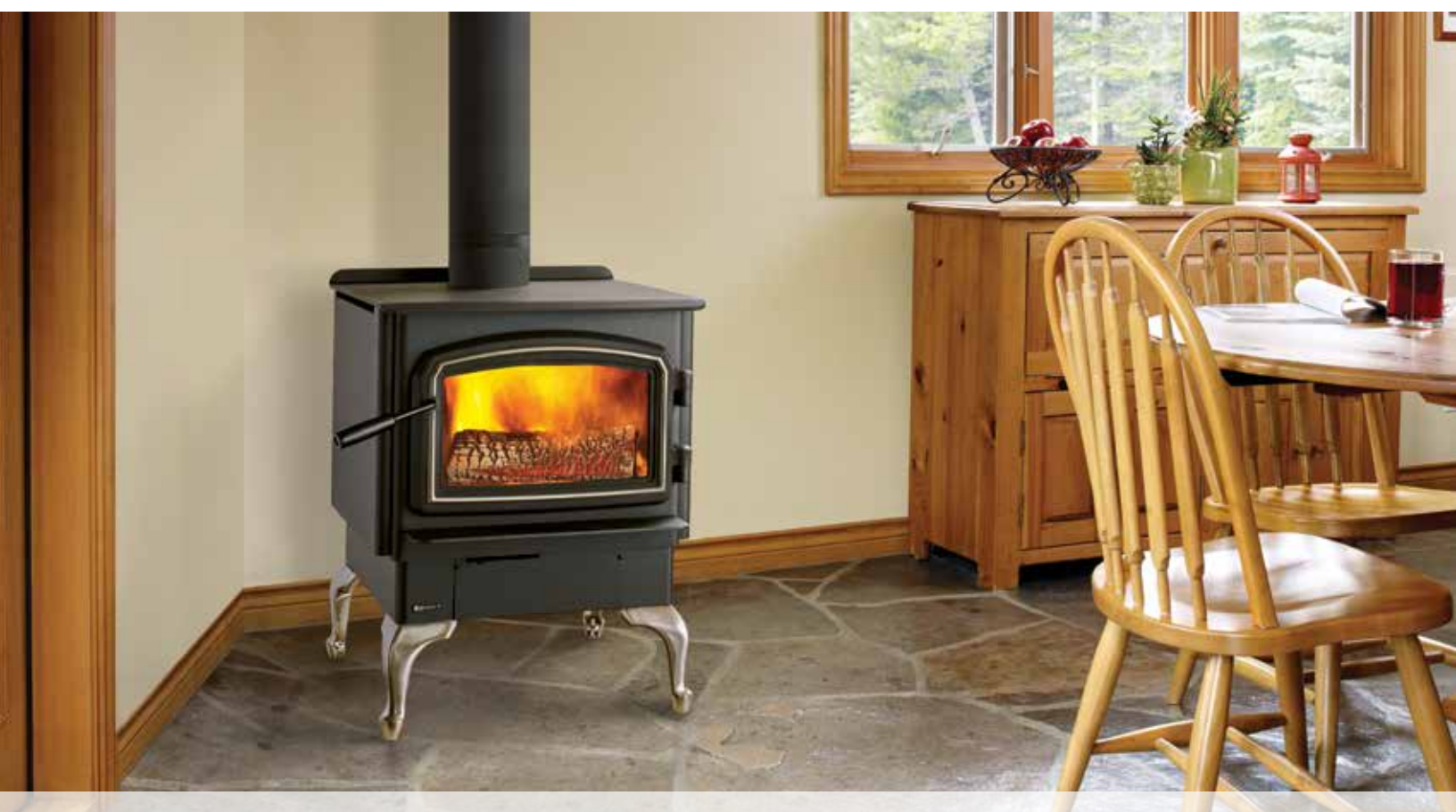
F2450 shown with nickel accent door, bottom heat shield & brushed nickel legs (rear heat deflector not shown).